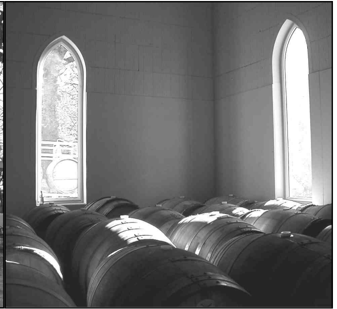
Left: Cantiga Winery-functional, but still in the works; Right: Barrels resting in their new home

B ud Rorden once told us, in his wisdom and experience, that in any new venture, one moves increasingly from order to chaos until at some point a pinnacle of chaos is reached, and at that point entropy reverses and things start falling into place.